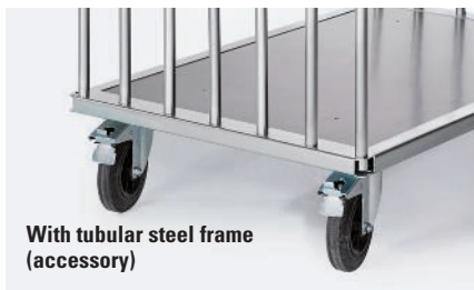
With tubular steel frame (accessory)