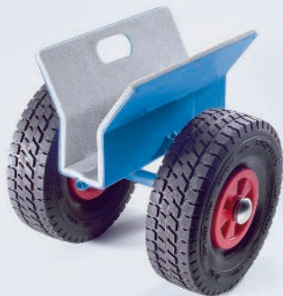
Punctureproof polyurethane tyres