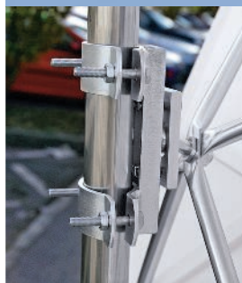
Ball joint bracket