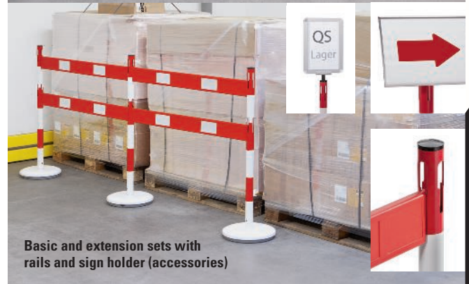
Basic and extension sets with rails and sign holder (accessories)