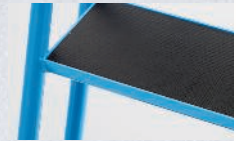
Steps and platform with phenolic plywood panels