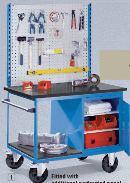
1 Fitted with additional perforated panel