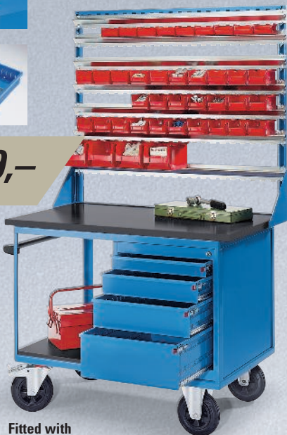
3 Fitted with additional rails