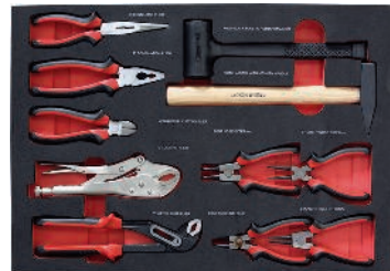
5 Pliers/hammer set, 11-piece