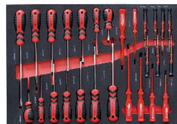
3 Screwdriver set, 21-piece