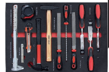
4 Universal tool set, 28-piece