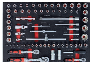
2 Box spanner set, 63-piece