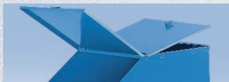
Split folding lid, delivered unattached