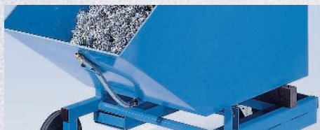
Drainage hose with metal braid – discharge fluids easily and cleanly (clamps in place to save space when not in use)