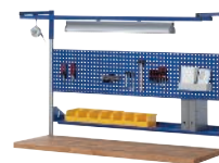
Workstation 2000 mm, bay width 2000 mm