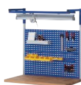
Workstation 1250 mm, bay width 1250 mm