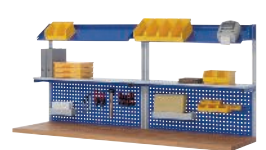
Workstation 2500 mm, bay width 1250 + 1250 mm