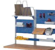
Workstation 1500 mm, bay width 750 + 750 mm