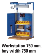
Workstation 750 mm, bay width 750 mm

For width 2000 mm with 4 uprights (bay width 1000 + 1000 mm)