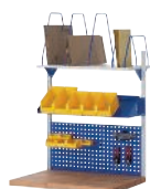
Workstation 1000 mm, bay width 1000 mm