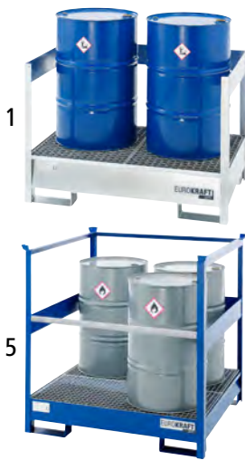
Stackable, open steel frame, for 4 x 200 litre drums with accessory protection bar