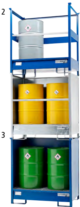
For 2 x 200 litre drums, up to 3 units can be stacked