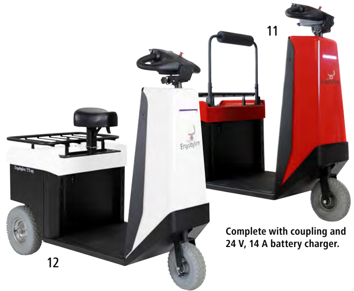
Complete with coupling and 24 V, 14 A battery charger.