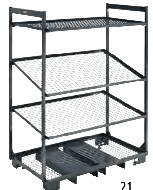
Forklift pockets 240 x 80 mm, fork entry clearance 350 mm.