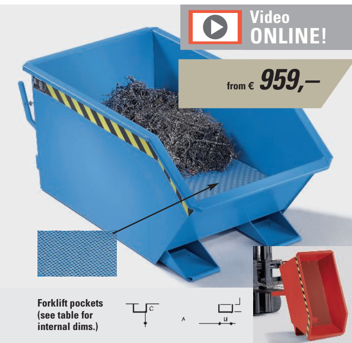
Forklift pockets (see table for internal dims.)