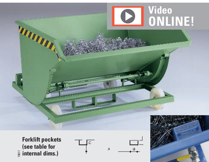
Forklift pockets (see table for internal dims.)