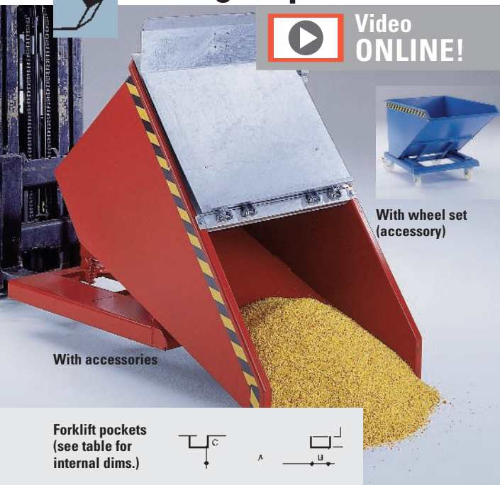
With wheel set (accessory)