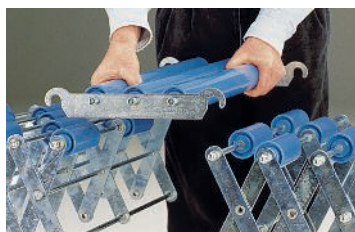
For roller conveyors