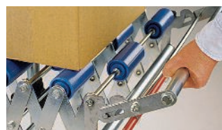
Folding end stop