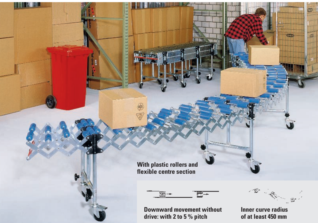
With plastic rollers and flexible centre section

Downward movement without drive: with 2 to 5 % pitch