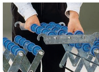
For skate wheel conveyors