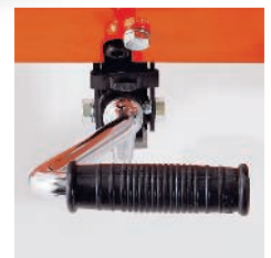
1 Compact with folding push handle