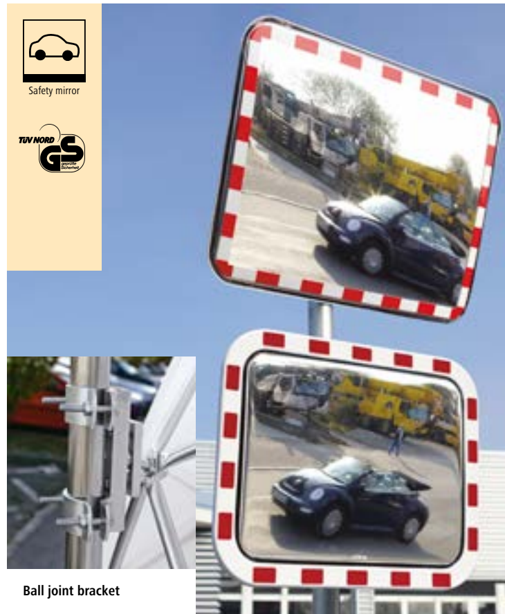
Ball joint bracket