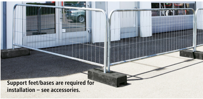
Support feet/bases are required for installation – see accessories.