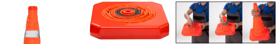
Pack of 2.