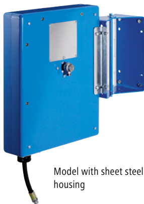
Model with sheet steel housing

Area of application: for air, water, or oil. Max. pressure up to: 60 bar. Nominal hose diameter: DN 12. External connection: G 1/2 inch. Housing material: painted, partially galvanised. Attachment option: Can be fastened to wall, ceiling, floor, machines and vehicles. Mechanism: return spring and locking mechanism. Type: without SCS® duplex brake.