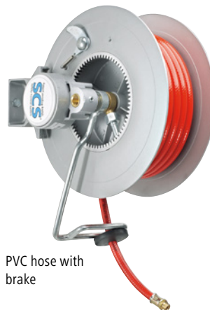
PVC hose with brake

Area of application: for air. Max. pressure up to: 15 bar. Nominal hose diameter: DN 10. External connection: G 3/8 inch. Housing material: cast aluminium. Attachment option: Can be fastened to wall, ceiling, floor, machines and vehicles. Mechanism: return spring and locking mechanism. Width: 166 mm.