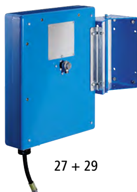
27 + 29