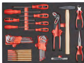
37 parts – hand tools