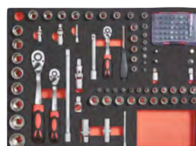
108 parts – sockets