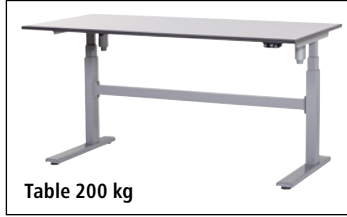
Table 200 kg

Supplied flat pack – easy self-assembly.