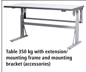
Table 350 kg with extension/ mounting frame and mounting bracket (accessories)