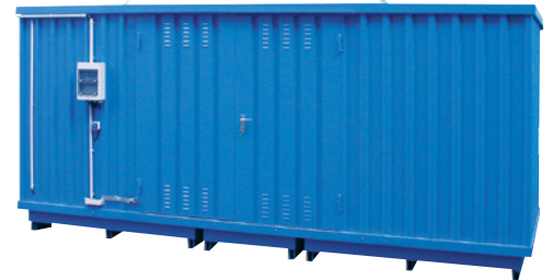
Additional exterior paintwork (extra cost)