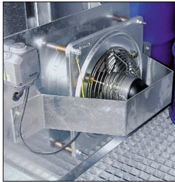
Explosion protected forced ventilation