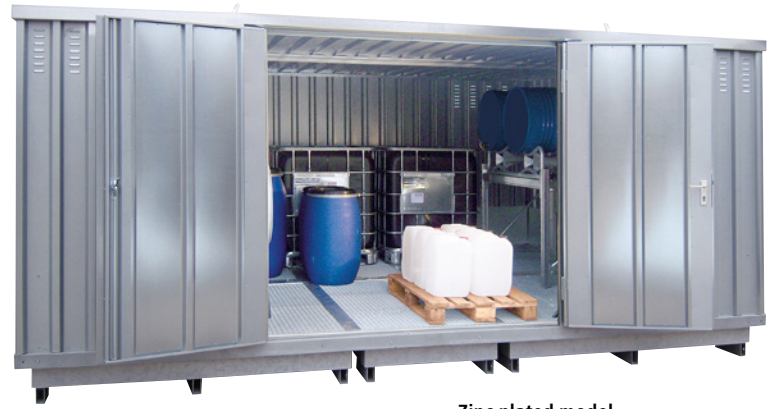
Zinc plated model

Material: steel profile. Type of floor: hot dip galvanised sump tray with grate, max. load 1000 kg/m 2 with evenly distributed load. Lock type: security lock. Finish: zinc plated. Door type: double hinged doors. Door height: 1900 mm. Test symbol: with general certification from the DIBt (German Institute for Construction Technology) Berlin. Hazard class: for the active storage of flammable substances in GHS categories 1 – 3.