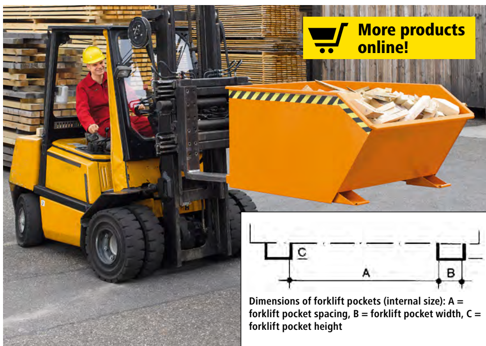
Dimensions of forklift pockets (internal size): A = forklift pocket spacing, B = forklift pocket width, C = forklift pocket height